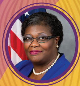
New York State Senator ROXANNE J. PERSAUD